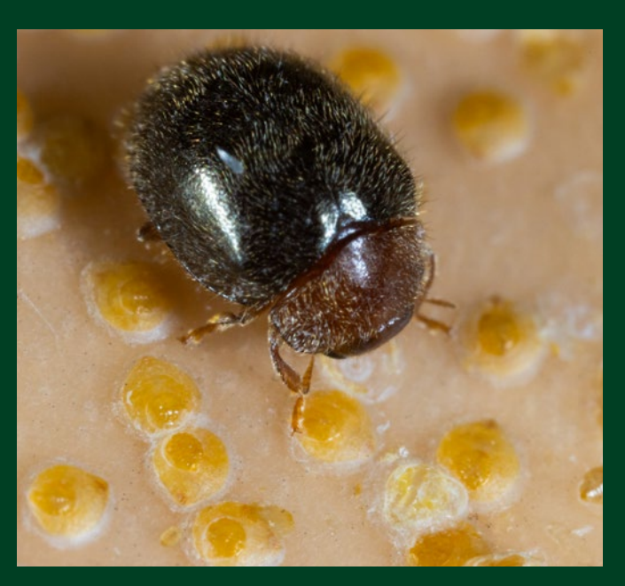
Small scales are consumed entirely.